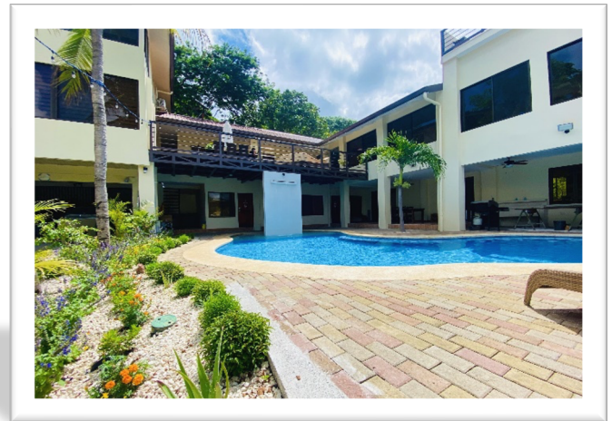
View from the first-floor rancho.