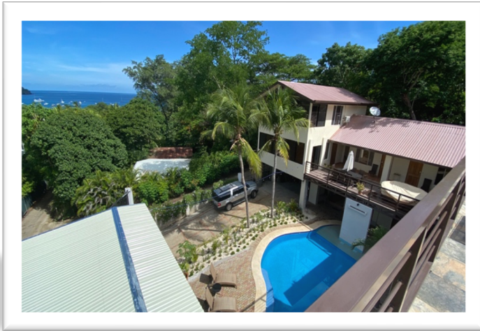
View from the third-floor terrace.