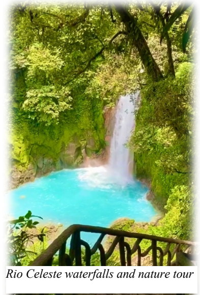
Rio Celeste waterfalls and nature tour